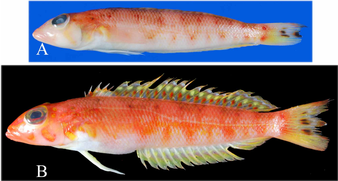
FIGURE 2. Parapercis randalli sp. nov., A. NMMBP 10463, paratype, 1 of 2 specimens, female, 102.2 mm SL, after 2 days preservation in formalin. B. QM I.38817, paratype, 96.9 mm SL, fresh caught specimen.

Origin of dorsal fin over 3rd lateral-line scales (2nd or 3rd in all paratypes), the predorsal length 3.2 (3.2–3.4) in SL, equal to head length; 1st dorsal spine 13.8 (7.4–15.7) in HL; 2nd dorsal spine 6.6 (4.7–6.6) in HL; 3rd dorsal spine 5.7 (4.2–5.7) in HL; 4th dorsal spine longest, 4.5 (3.5–4.5) in HL; 5th dorsal spine 4.7 (4.3–4.9) in HL, entirely attached to 1st soft ray by membrane; last dorsal soft ray longest, 2.3 (1.9–2.4) in HL; origin of anal fin below base of 4th dorsal soft ray, the preanal length 2.2 (2.1–2.2) in SL; anal spine 8.0 (6.5–8.8) in HL; last anal soft ray longest, 2.5 (2.3–2.5) in HL; posterior margin of caudal fin slightly rounded on ventral half, a small notch at middle, truncate on dorsal half, with a prolonged upper lobe centered on 3rd branched ray, extending about 2/3 orbit diameter posterior to central margin of fin, the total fin length 4.6 (4.5–4.9) in SL, 1.4 in HL; pectoral fins broadly rounded when spread, the tenth ray longest, 5.1 (4.8–5.1) in SL, 1.6 (1.4–1.6) in HL; origin of pelvic fins anterior to that of pectoral fin, below base of exposed part of opercular spine, the prepelvic length 3.7 (3.6–3.8) in SL, 1.1 (1.1–1.2) in HL; pelvic spine slender, 4.7 (4.3–4.7) in HL; pelvic fins extends beyond the anus (slightly beyond in 96.9-mm paratype), the fourth soft pelvic ray longest, 5.1 (5.0–5.6) in SL, 1.6 (1.4–1.6) in HL.