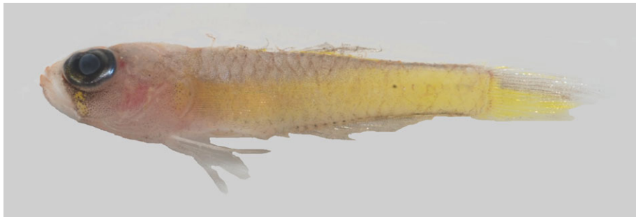
FIGURE 1. Obliquogobius fulvostriatus n. sp., holotype, NSMT-P102090, 24.3 mm SL, 141–165 m depth, Kumejima, Ryukyu Islands, Japan.

widens such that posterior half of body is uniformly yellow; band immediately decreases in width at the origin of caudal fin, covering only lower two-thirds of C region; upper third of C dusky, due to random small black spots on fin membrane; yellow longitudinal band does not persist in preservative; lower two-third of C hyaline in preservative; D1 slightly damaged but some melanophores observed distally; D2 hyaline with thin longitudinal yellow stripe at base, stripe does not persist in long preservative; P, V and A hyaline.